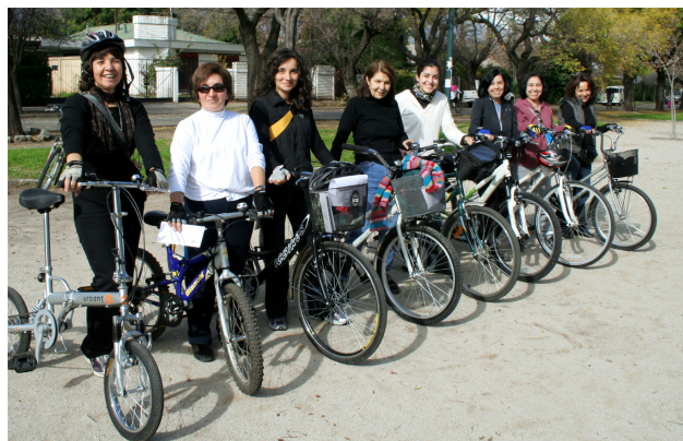
Figure 1. Proud graduates of Santiago's first ever Cycling School, in this case for women who had never ridden a bicycle before. Organized by the women's cycling group, Macleta , and Living City, 12 women from 17 to over 60 years of age mastered riding a bicycle through 12 weekend sessions in 2008.

In the ensuing years, Living City has moved ahead on several fronts (it has also experienced some major setbacks), producing Chile's first Green Map, which includes routes for cyclists despite the lack of specialized infrastructure. It also worked with the Macletas , a women's cyclist group, to de-