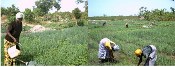
Figure 3. Women working in the market gardens.