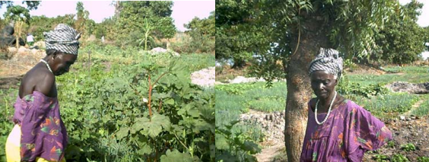
Figure 4. An elderly woman explaining the medicinal virtues of certain plant species (Source: Fall, 2007).

they are involved daily in the production of tomatoes, onions, lettuce, beets, cucumbers, green beans, mint, parsley, leek and sweet potatoes (Fig. 3). Most of the produce is sold locally and the profits are kept in a women's solidarity fund, which allows them to deal with unforeseen circumstances as necessary. With the funds obtained, they also intend to establish a micro-business to process and package tomato juice and paste, dry mint and parsley, and provide food service for the ecotourism complex.