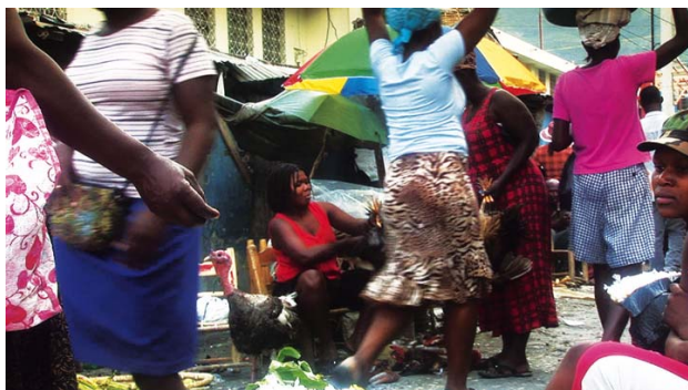
Figure 2. Street scene – most of Haiti's economic activity is in the informal sector.