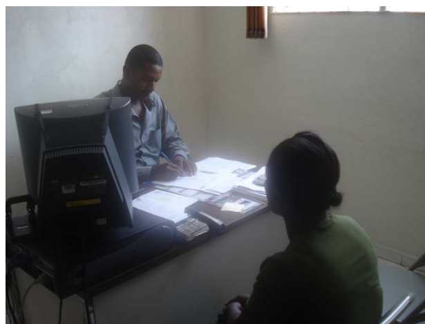
Figure 1. Access to a “GHESKIO loan” remains entirely confidential following ACME’s normal procedures.

Those meeting the preliminary criteria are referred to ACME who regularly organise a training course for groups of some twenty candidates. The two-day course aims to teach basic business management principles and to explain the commitments ensuing from the microcredit procedure. At the end of the course, a one-to-one meeting is arranged to prepare the microcredit application file. At this point, some participants decide not to take out a loan (1–3 per training session).